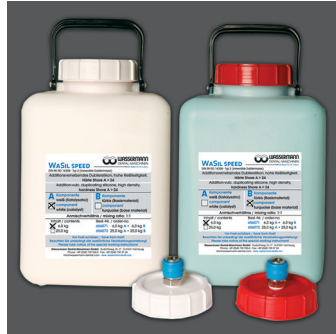
WaSil speed, 6 kg cask, hardness Shore A: > 24