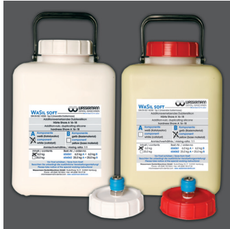
WaSil soft, 6 kg cask, hardness Shore A: 16-18