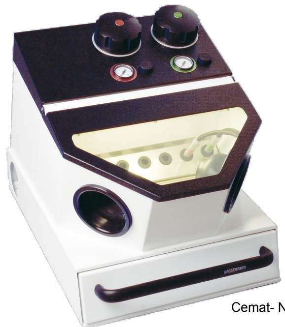
Cemat- NT 2