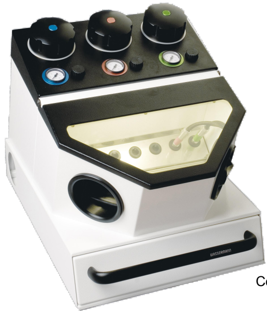
Cemat- NT 3