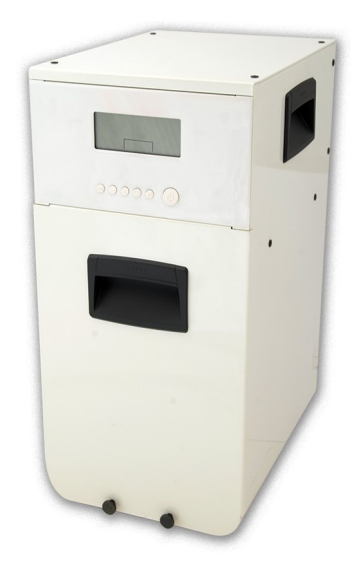
* SG-Economy 140970

The orthodontic grinding table KMS can be delivered also in Swiss and EOS version.