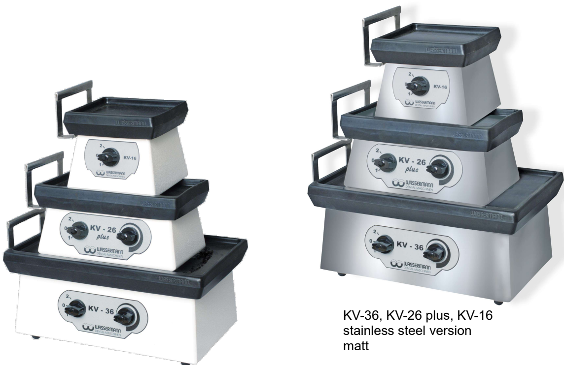
KV-36, KV-26 plus, KV-16 stainless steel version plastic-powder coated (natural white close to RAL 9016)