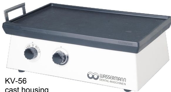
KV-56 cast housing plastic-powder coated (natural white close to RAL 9016)