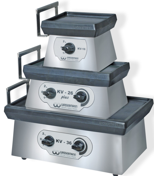
KV-16, KV-26 plus, KV-36 stainless steel version matt