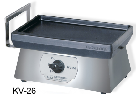
KV-26 stainless steel version matt