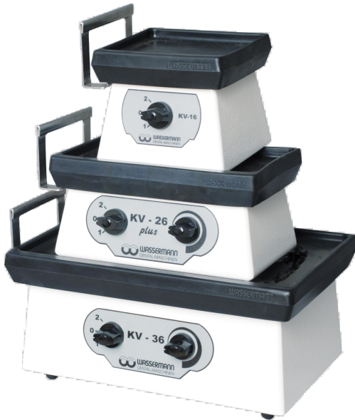
KV-16, KV-26 plus, KV-36 stainless steel version plastic-powder coated (natural white close to RAL 9016)

KV-16 / KV-26 / KV-36 (110-120 V / 50/60 Hz)