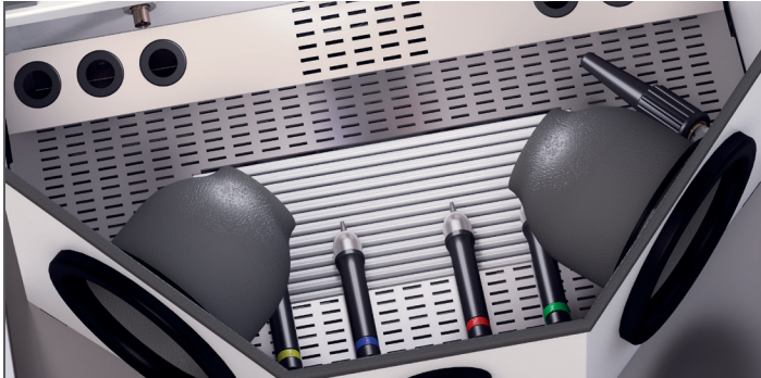
Ergonomically shaped handpieces and a separate air blasting nozzle