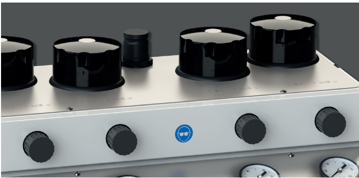
Chambers with individual working pressure, 0.8–6 bar