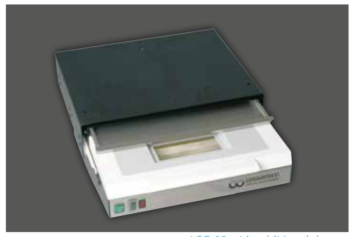
LSG-02 with additional drawer