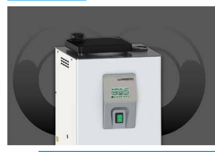
Pressure Polymerisation Unit and Compactor