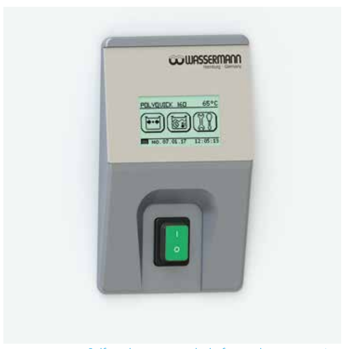
Self-explanatory symbols, fast and easy operation