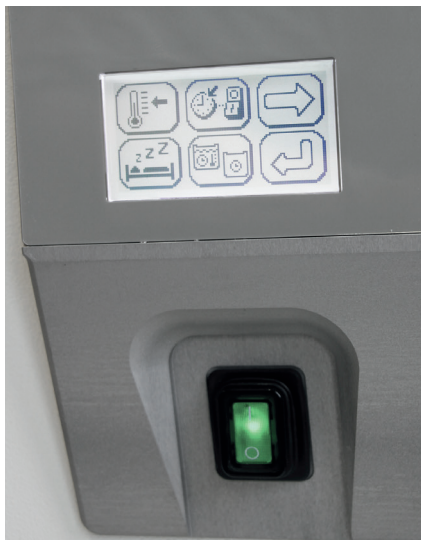
Self-explanatory symbols, fast and easy operation