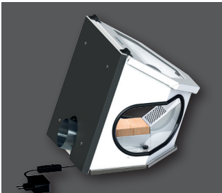
Suction Box Compact III , basic equipment, with optional mounting possibilities for the extractor nozzle in the front or in the rear