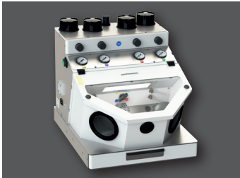
Cemat-4 II (also available as 3 chamber version and 2 chamber version)

Our low pressure suction units in combination with the suction box or the fine blasting units guarantee excellent health protection and the highest degree of profitability. We also supply the appropriate blasting material.