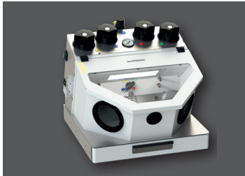
Gobi Comfort-4 (also available as 3 chamber version and 2 chamber version)