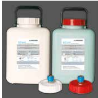
WaSil speed, hardness Shore A: > 24, 6 kg cask