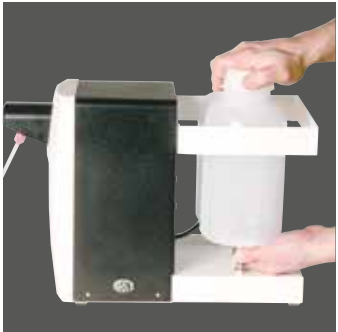
Material container, 2 x 2 L, incl. in delivery