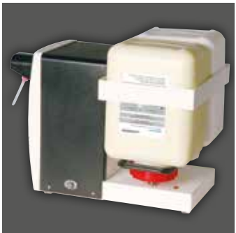
Sidomix with 6 kg cask