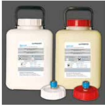
WaSil soft, hardness Shore A: 16-18, 6 kg cask