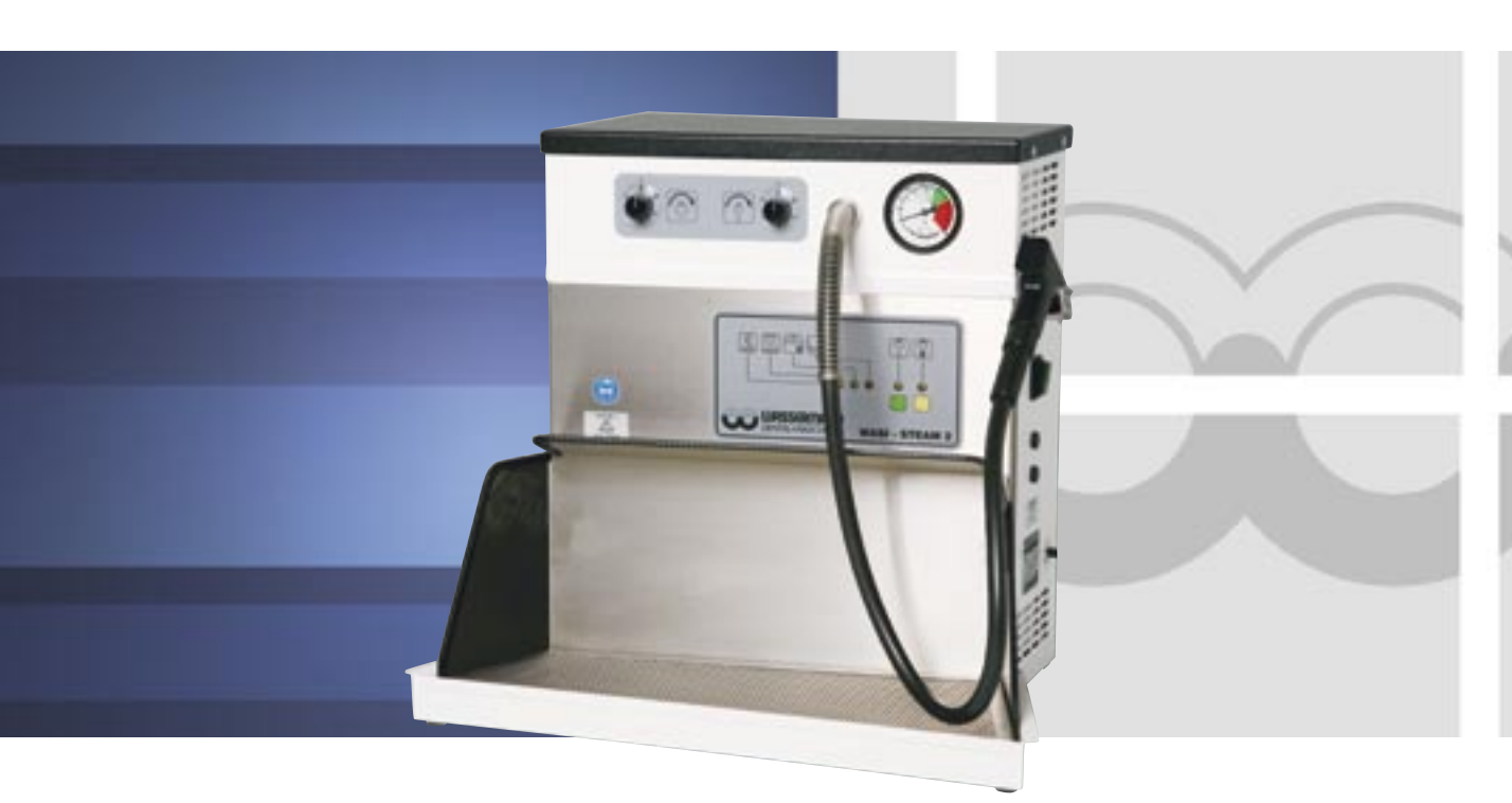
Wasi-Steam 2 with accessory splash protection