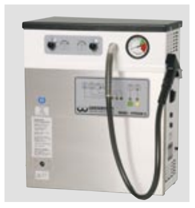
Wasi-Steam 2 without accessories