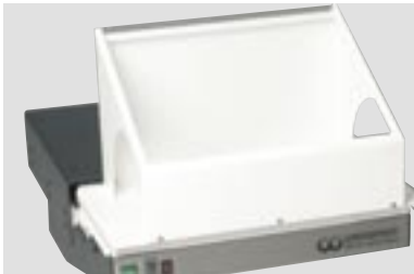
LSG-02 DE with universal extractor hood