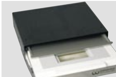
LSG-02 DE with additional drawer