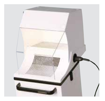
Timobil with special accessorie extractor Timobil with special accessorie hood with illumination