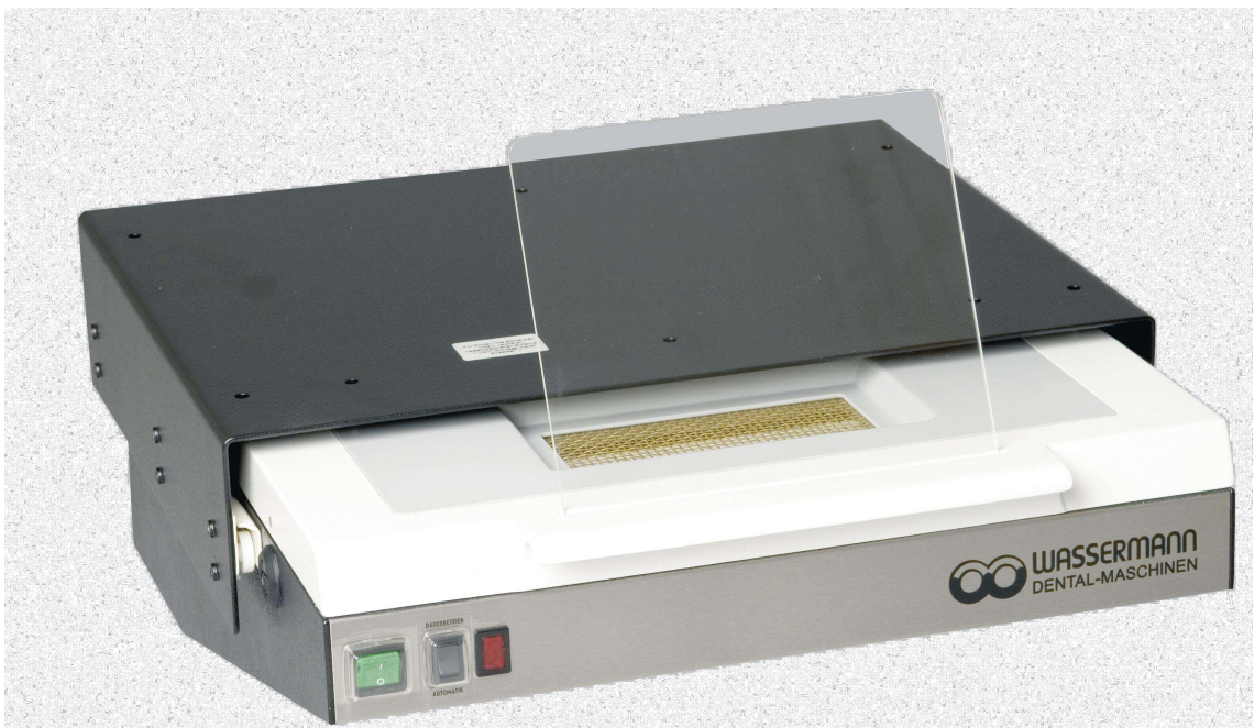
LSG-02 DE equipped with an auto-start-system