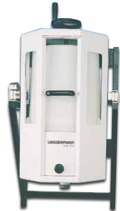
WGS-25W, Wall-mounted Model

Other voltages on request · Technical changes reserved