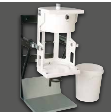
Easy and time-saving filling