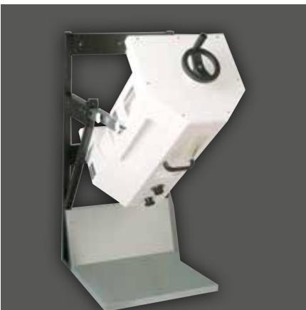
WGS-25 Benchtop Model, also available as Wall-mounted Model