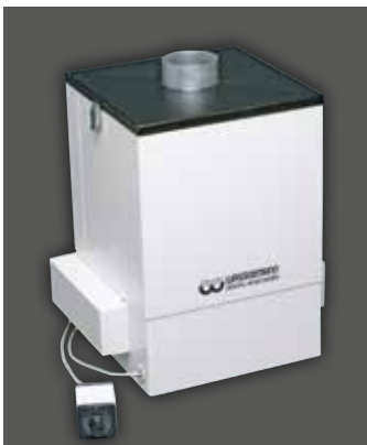
SG-10 innovative filter concept, wide range of filters available