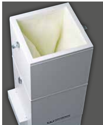
SG-10 base with module filter add-on