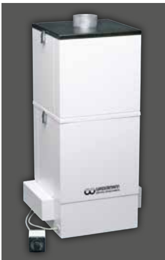
SG-10 modular filter system for different applications