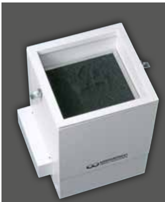
SG-10 base with module activated carbon filter