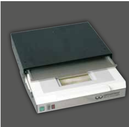
LSG-02 with additional drawer