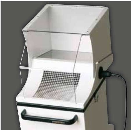
Timobil with accessory extractor hood