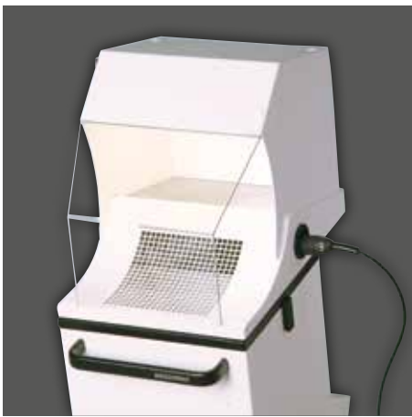
Timobil with accessory extractor hood with illumination