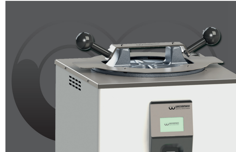
Pressure polymerisation unit and compactor