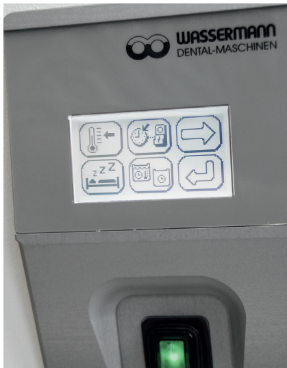
Self-explanatory symbols, fast and easy operation

Further information are available on our website at www.wassermann.hamburg