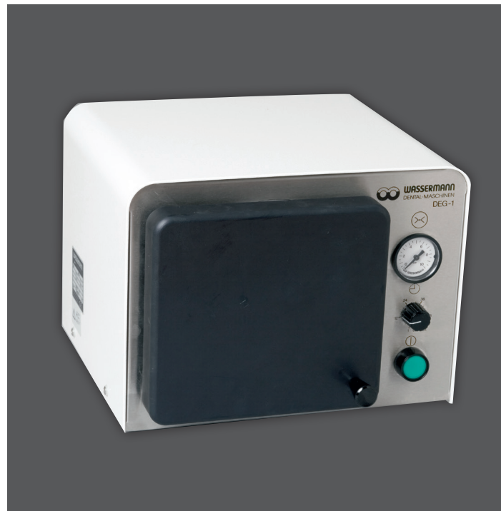
Designed to take several muffles at the same time