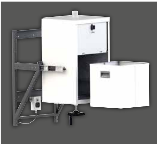
Easy and time-saving filling