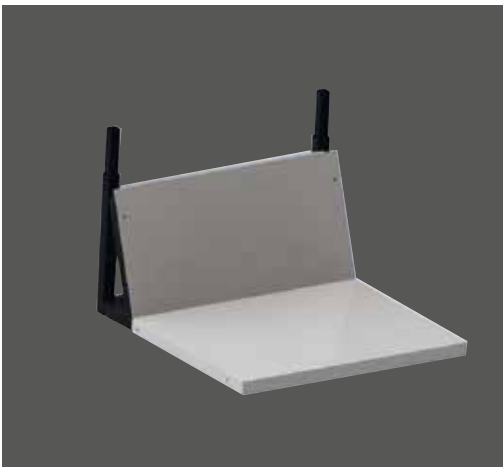
Table-top frame available as accessory