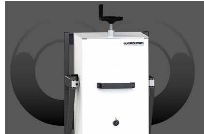
Plaster Storage Bin